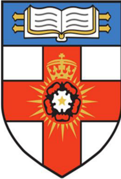
Figure 1. The University of London's Coat of Arm.