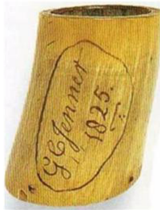
Figure 10. This horn belonged to a cow used by Jenner to provide cowpox infected fluid to vaccinate people against smallpox, an appalling disease.