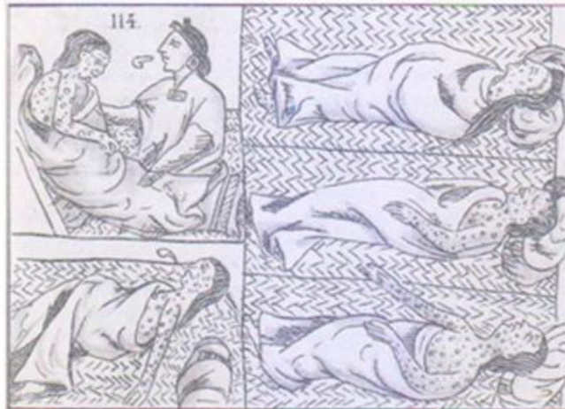
Figure 8. These pictures of infected people come from a twelve-volume compendium of Aztec history and culture compiled by a Catholic missionary scholar called Fray Bernardino de Sahagún (c. 1499-1590).

In the past, 20 to 30 percent of the afflicted with severe Asian strain died. Survivors were permanently scarred and sometimes blinded. There is no specific treatment for smallpox.