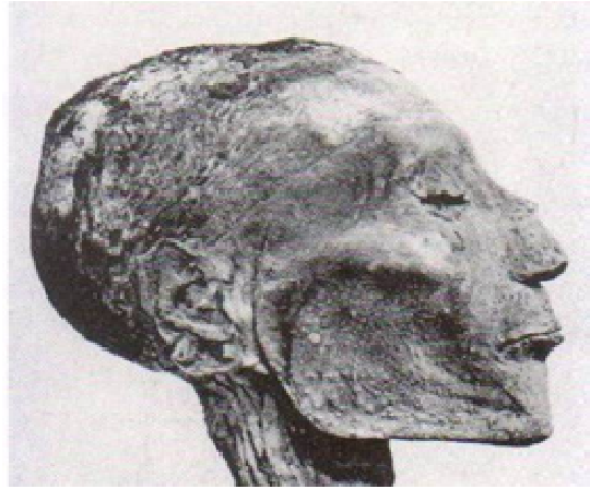
Figure 5. Mummified head of the Pharaoh Rameses V, 1160 BC, showing lesions thought to be those of smallpox.