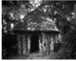
Figure 9. Jenner's Temple of Vaccina.