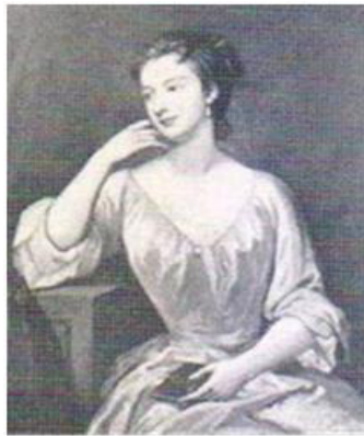
Figure 12. Lady Mary Wortley Montagu who ordered the embassy surgeon, Charles Maitland, to inoculate her 15-year-old son.