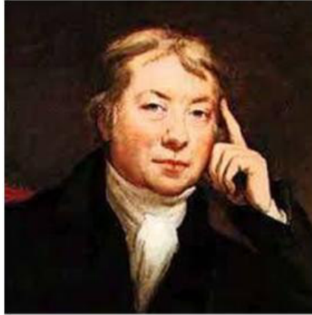
Figure 7. Edward Jenner the British Lifesaver.