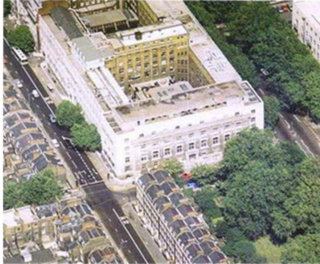
Figure 4. London School of Hygiene and Tropical Medicine.

at least four monarch, 52 president or prime minister, 74 Noble Prizewinners, six Grammy winners, two Oscar winner, three Olympic gold Medalists.