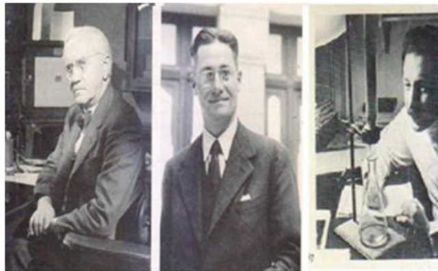
Figure 15. Right. Howard Florey who, with Ernst Chain led the Oxford team that successfully isolated and purified penicillin successfully. Middle. Alexander Fleming, the discoverer of penicillin, in his laboratory, in 1951. Left. Ernst Boris Chain whose studies with Howard Florey established the great therapeutic properties of penicillin.