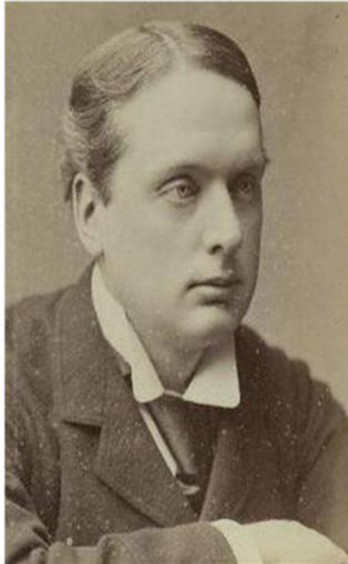
Figure 3. Archibald Primorse, the 5th Earl of Rosebery, the Chancellor of the University of London (1902-1929).

Royal Postgraduate Medical School, incorporated by Royal Charter, in 1931, is housed on the site of Hammersmith Hospital.