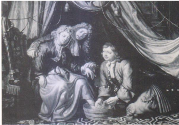
Figure 6. A well-to-do young patient is being treated by a physician (wearing a wig) who is taking her pulse.

cine was Avicenna (980-1037) whose standing both in Islamic and Christendom was equal to Galen (129-200), the famous Greek physician and prolific writer (Pūyān, P. 23), who wrote al-Nabḍ in Persian. The book discussed regarding pulses and vessels and definitely belongs to Avicenna. Manuscript of this medical work are available in the libraries of Iran and abroad. It consists nine chapters (Pūyān, PP. 41 and 42).