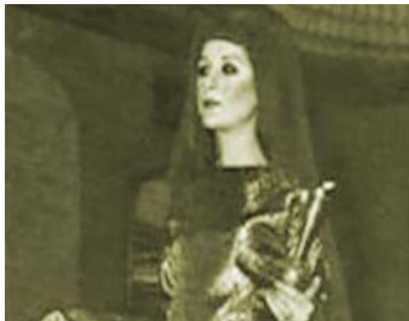
Figure 9. Sayyida Shīrīn (d. 1028 AD/ 419 AH), the widow of Fakhr al-Dawla.