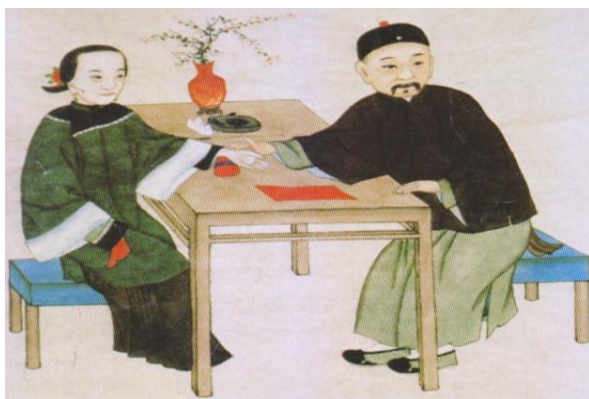
Figure 1. Doctor shown examining patient by feeling the pulse, perhaps to most important feature of ancient Chinese medical diagnosis.

The examination was on both wrists simultaneously and the best time for the examination was thought to be the early morning. The description of the pulse is based upon the various stages of interaction between yin (disease; the passive dark female principle of the universe) and Yang (health; the active bright male principle of the universe) as per Chinese medicine. (Khazir, PP. 1-2).