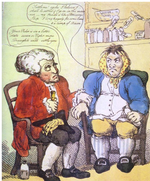
Figure 4. This etching of 1799 lampooning a physician telling his patient that his treatment will continue. The patient is visiting the physician in his surgery, there are medicines behind him.

In general, eighteenth century physicians rested content with the traditional diagnostic uses of the “five sense”; they would feel the pulse (Figure 4), sniff for gangrene, taste urine, listen for the breathing irregularities, ties and attend to skin and eye color-looking out for the facies Hippocratica, the cast on the face of a dying person. These time-honored methods were almost exclusively qualitative. Thus, what standardly counted in “pulse lore” was not the number of beats per minute (as later), but their strength, firmness, rhythm, and “feel”. Some attention was given to urine samples, but the historic art of urine-gazing (uroscopy) was now repudiated as the trick of the quackish “pisse prophet”: serious chemical analysis of urine had barely begun.