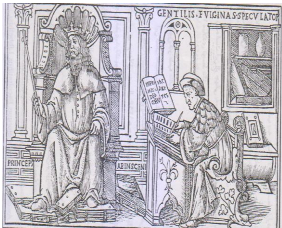
Figure 10. In this edition (Venice, 1522), Avicenna is pictured as a medieval professor dictating to a student the later commentator, Gentile da Foligno (d. 1348).