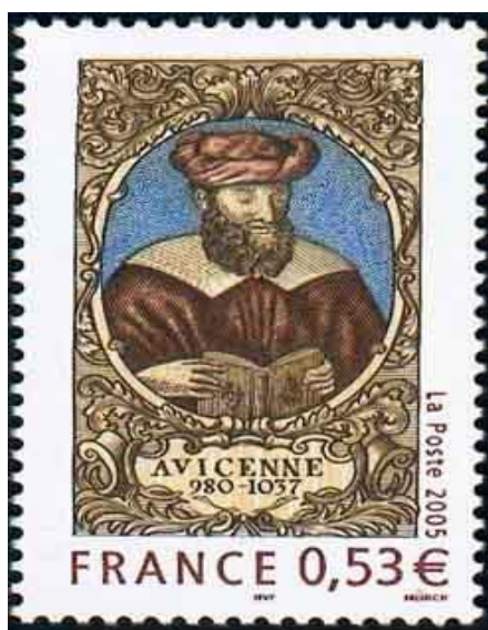
Figure 7. Avicenna (980-1037), one of the Islam’s greatest intellects, authored al-Qanun (the Canon), probably the most influential text of all the time, Shifā, and “Andar Dānish-i Nabḍ.”