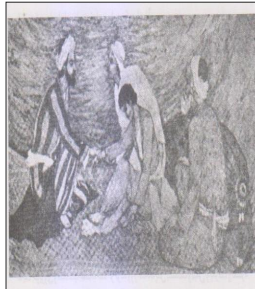
Figure 8. Avicenna feeling the young patient's pulse.