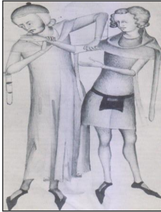
Figure 2. Taking the pulse at the brachial artery. As the text explains, this procedure is relatively late stage in examining a patient (11th century).

Rufus of Ephesus (98-117) Greek physician who authored “On the interrogation of the patient” gave the earliest description of the thymus, wrote on the eye, liver, heart and pulse, gout, bubonic plague and erysipelas (Lee, P. 32). He recognized the heart-beat as the cause of the pulse and discussed its many properties (Lyons, P. 249).