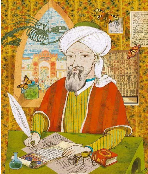
Figure 11. Miniature of Avicenna.

transmitted by al-Fārābī and Ibn Sīnā, can be reduced to three parts: a part which must be branded as unbelief; a part which must be stigmatized as innovation; and a part which need not be repudiated at all. (Avicenna-Wikipedia)