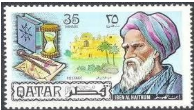
Alhazen (965-1038), from Basra who founded the physiological optics and was the first to study the properties of light and convex lenses.